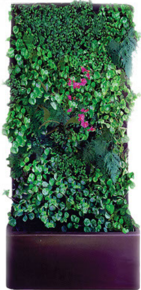
R 90 180