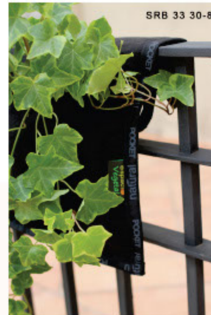
SRB 33 30-8